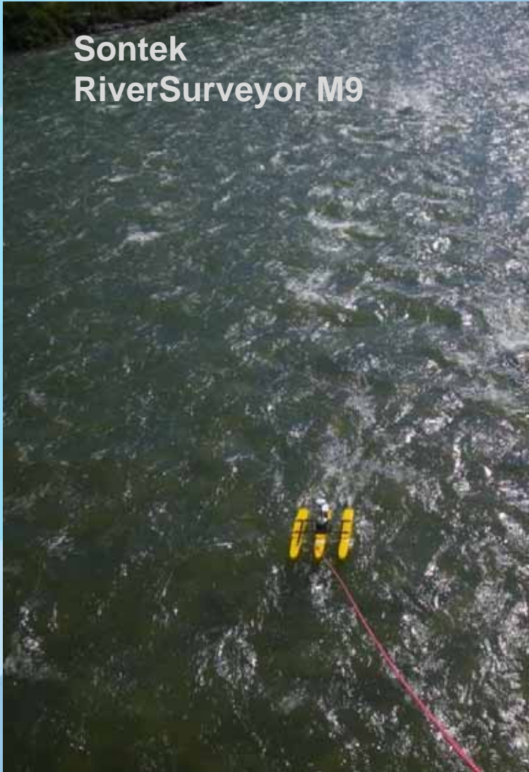
Sontek RiverSurveyor M9